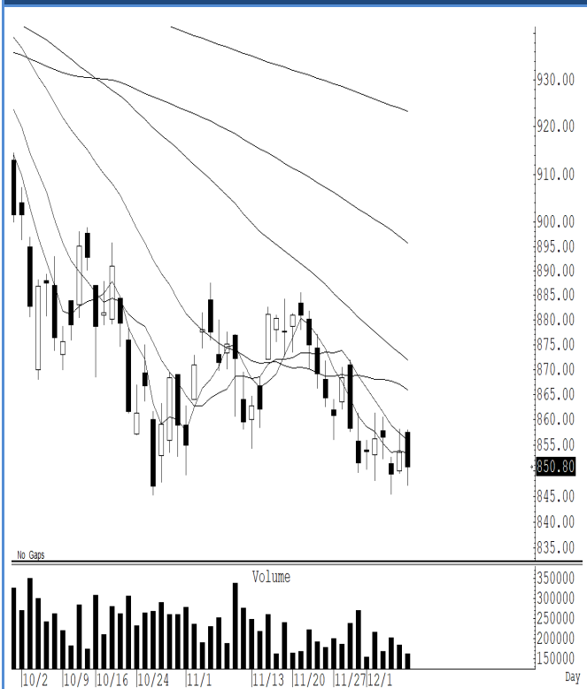
S50Z23 (Close 850.80 Chg -2.80)

ปรับตัวลงไป แต่ยังไม่ถึงจุดต่ำใหม่ ทิศทางยังเป็นการแกว่งออกด้านข้าง วันนี้ดีดกลับไม่ข้ามแถว ๆ 855-858 จุด แนะนำ trading ในกรอบระหว่าง 855-840 จุด ระวังถ้าไร